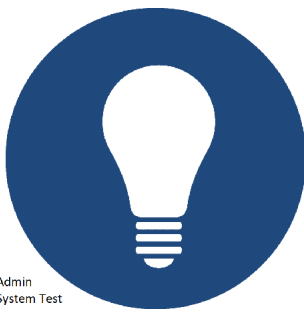
Admin System Test

The approx. 34,500 m 2 former IKEA site is superbly connected, can be flexibly sub-divided, and is available immediately. The site offers an ideal environment for prestigious business establishments.