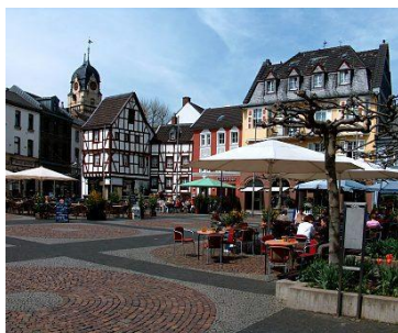
Alter Markt, Euskirchen