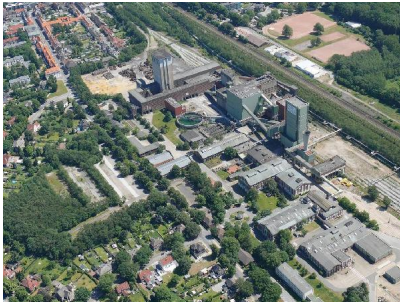
Schrägluftbild BW Westerholt Herten.jpg