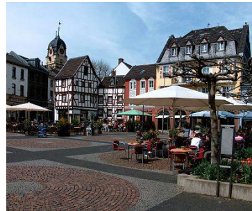
Alter Markt, Euskirchen