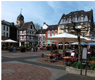
Alter Markt, Euskirchen