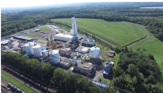
Südweiterung 3 Chemiepark Knapsack.JPG