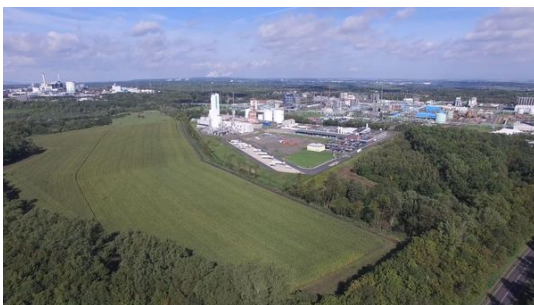
Südweiterung Chemiepark Knapsack.JPG